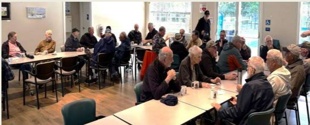
Coffee at the senior center

Where else can you get a pastry and unlimited coffee for $1?