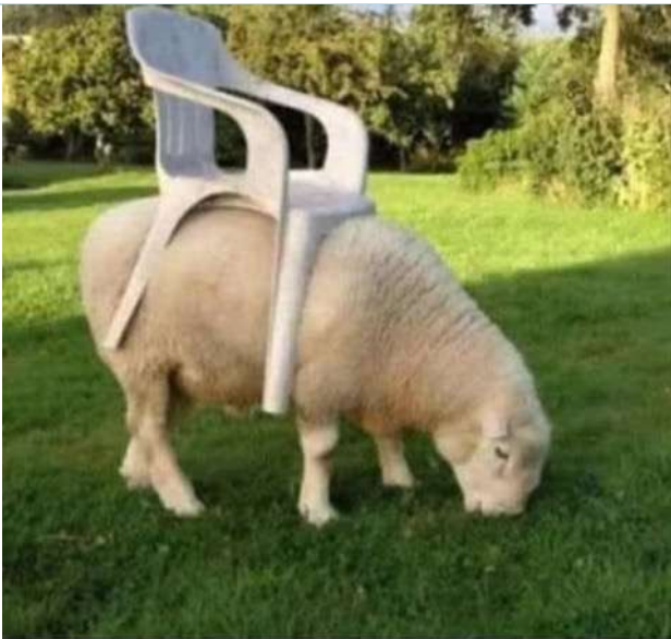
Riding Lawnmower $300

Once upon a time, there lived a king who was only 12 inches tall. He was a terrible king, but he made a great ruler.