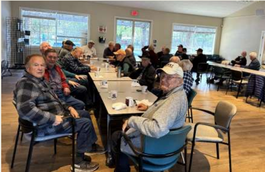
Coffee at the senior center

Bringing a guest to coffee for them to get a feel for the group is a simple and great way to recruit. Tuesday Morning 9am coffee session continues to be busy and a fun time.